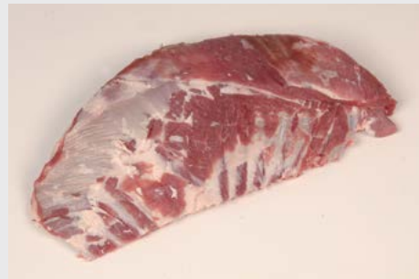
6. Fully trimmed rib section.