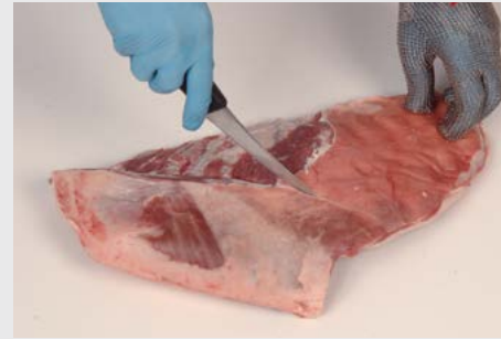
3. Remove excess fat