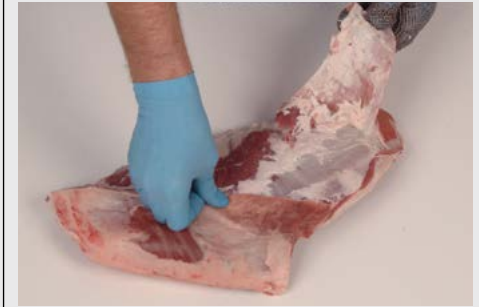
4. and skin (bark) as