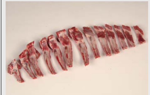
8. to create individual ribs.